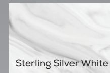
Sterling Silver White