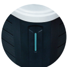
LED Corner Panels